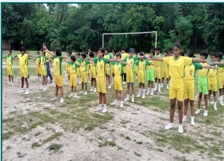
Kishalay Sports Academy