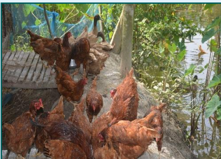
Chicken & Duck Farming