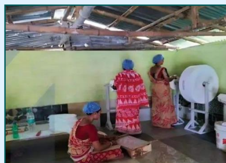
Sanitary pad production unit