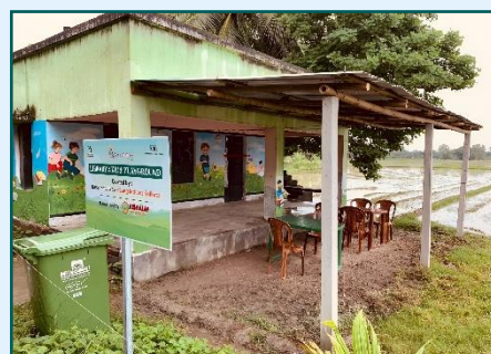
Kids Library & Playground